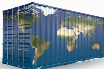
Export Control Compliance