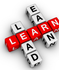
Facilitation & Training